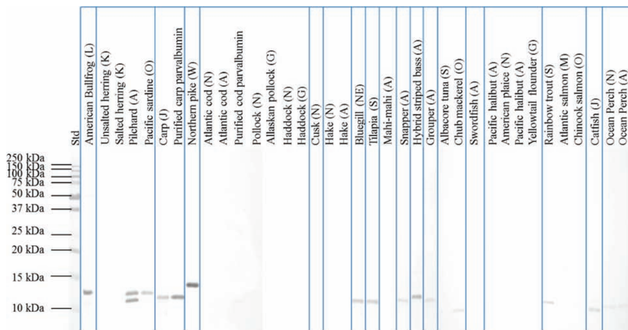
Figure 3. IgG-immunoblot analysis of the antifrog MoAb reactivity with the raw muscle protein extracts of frog and fish species.

Moreover, the anticarp MoAb reacted to the remaining fish species, with the exception of frog, mahi–mahi, swordfish, and all fish species in the order Pleuronectiformes and ocean perch.