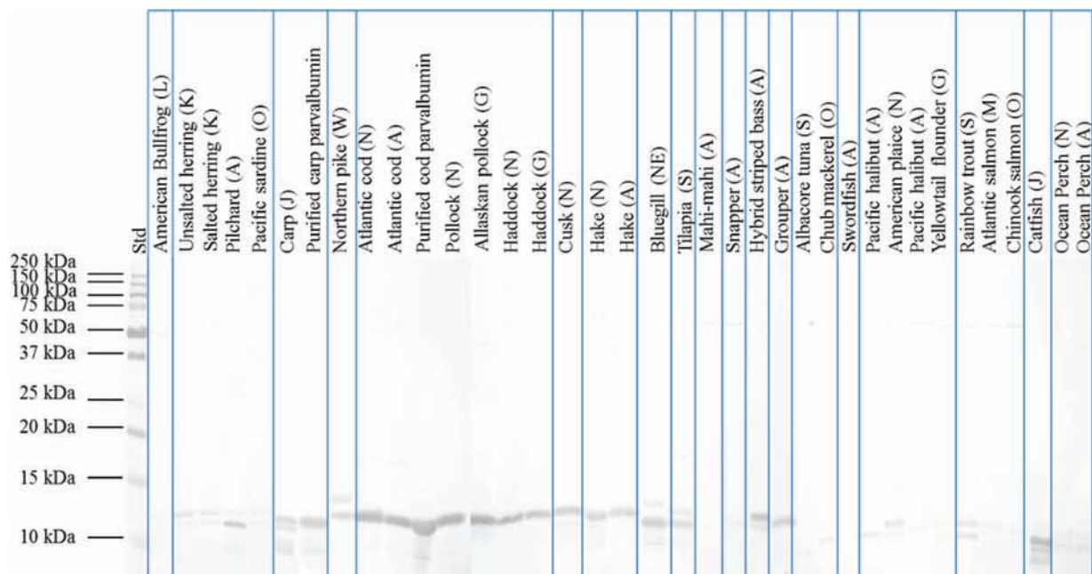
Figure 5. IgG-immunoblot analysis of the anticod PoAb reactivity with the raw muscle protein extracts of frog and fish species.

The polyclonal anticod parvalbumin antibody showed reactivity to the widest range of fish species probably due to the recognition of multiple epitopes based upon the polyclonal nature of the antisera. In comparison, the monoclonal antifrog parvalbumin antibody showed the least cross-reactivity due to the recognition of a single epitope and the frog parvalbumin being less homologous to fish than cod parvalbumin. The anticod parvalbumin antibody appeared to be more suitable for the detection of parvalbumin derived from different fish species; however, limitations still exist regarding the inconsistent binding to different fish species. These 3 antiparvalbumin antibodies can potentially be