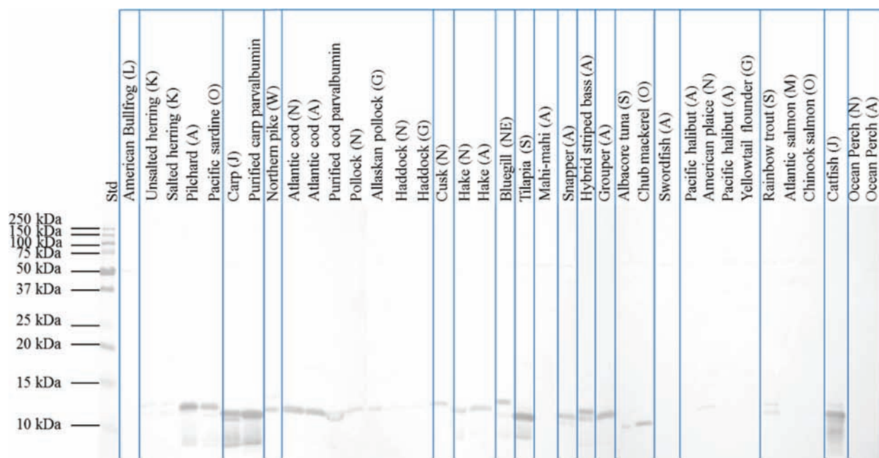
Figure 4. IgG-immunoblot analysis of the anticarp MoAb reactivity with the raw muscle protein extracts of frog and fish species.